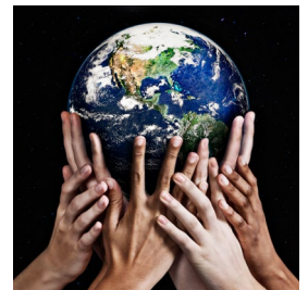
World Fellowship Recipients

Organizers of the 2021 Portland International Conference are planning tours (July 6-7) and preconference sessions (July 7). Tours will include the Mt. St. Helens volcano, Multnomah Falls, Mt. Hood and fruit/wine country, hop on/off circuit of the Rose City, and a trip to the early settlement of Lewis and Clark near Astoria and the Pacific Ocean. Provided by a separate company, tours will be detailed further in the March/April DKG NEWS . See CONF. p. 3