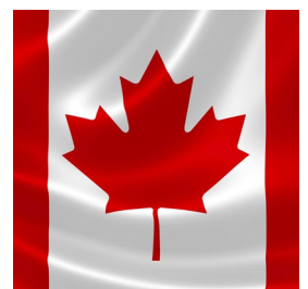
International Update: Canada