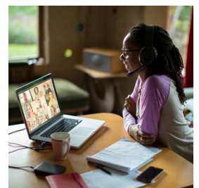
ISF Virtual Presentations