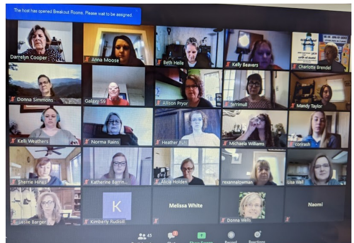
Some of our Alpha Nu Sisters in Caldwell and Burke Counties.